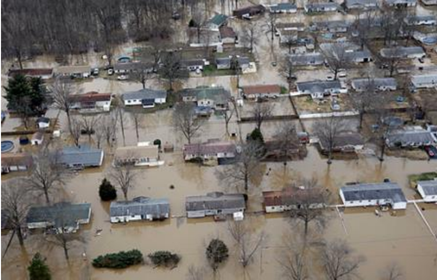
In this aerial photo taken on 12/31/15, homes in Arnold, MO, are surrounded by floodwaters.

As the immensity of what is unfolding on countless fronts becomes ever more apparent to the formerly sleeping masses, the power structure will be more dangerous than ever. Global conflict has always been the final option of choice for the military industrial complex and the central banking cartel. The Bush family history provides a shocking look into the tyranny of the global elite. How many are aware of their involvement with the funding of Nazi Germany? Now we have Obama and ISIS , the tyranny is still the same. We will face challenges in 2016 that are as of yet unimaginable to the vast majority. The danger now posed by those in power is more extreme and immediate than ever before. The January 2nd installment of GeoengineeringWatch radio is below.